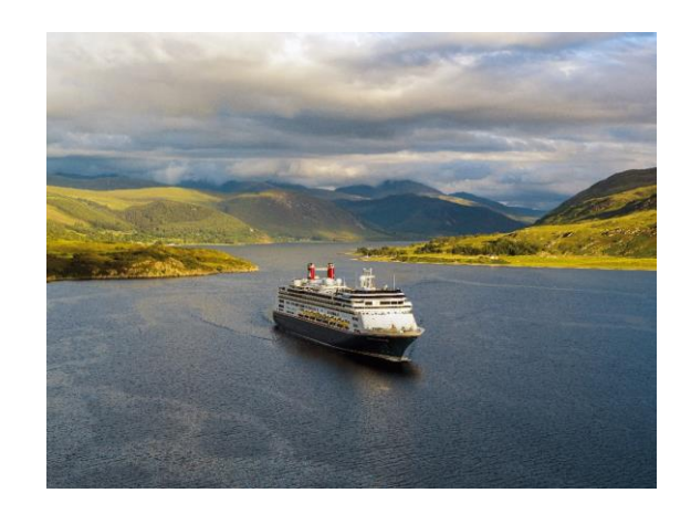
Sail aboard our smaller ships

In addition to our campaign assets, the below proof points will assist you in all your own consumer facing promotions. You can find a great selection of images to use in our recently updated Image Library on the Travel Agent Centre. fredolsencruises.com/agent