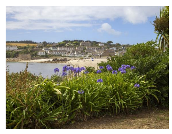
Explore our imaginative itineraries

Our elegant, smaller ships are spacious and uncrowded, with lots of restaurants and lounges for you to relax in. And because they're smaller, you'll get to visit places the bigger ships simply can't reach.