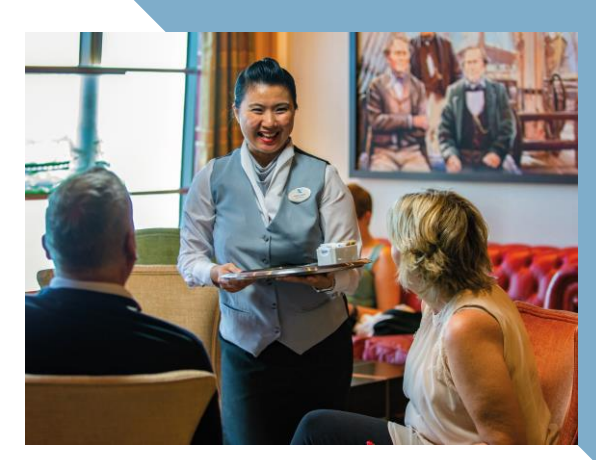
Travel in the best of company

With our new Signature Experiences, you'll enjoy the journey as much as the destination. Spot wildlife on deck, take in the night sky with an astronomer, and sample local cuisine in our cookery classes